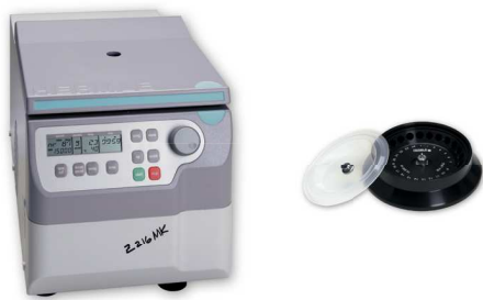
Refrigerated Microlitrecentrifuge Z 216 MK

max. Speed: 15000 rpm max. Volume: 44 x 1,5/2,0 ml Example rotor: Angle rotor 24 x 1,5/2,0 ml