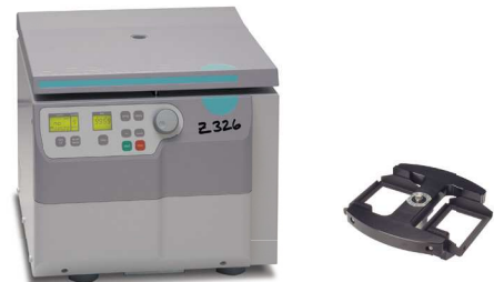
Universal Centrifuge Z 326

max. Speed: 18000 rpm max. Volume: 4 x 100 ml Example rotor: Swing out rotor 4 Places