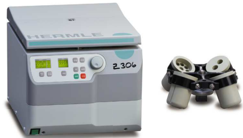
Universal Centrifuge Z 306

max. Speed: 15000 rpm max. Volume: 44 x 1,5/2,0 ml Example rotor: Angle rotor 24 x 1,5/2,0 ml