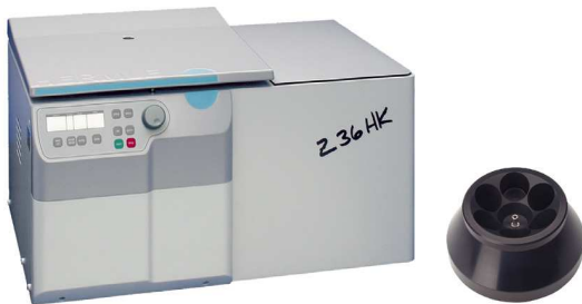
Refrigerated High-Speed Centrifuge Z 36 HK

max. Speed: 18000 rpm max. Volume: 4 x 100 ml Example rotor: Swing out rotor 2 x 3 Microtitreplates