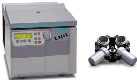
Refrigerated Universal Centrifuge Z 326 K

max. Speed: 13500 rpm max. Volume: 4 x 100 ml Example rotor: Swing out rotor 4 Places