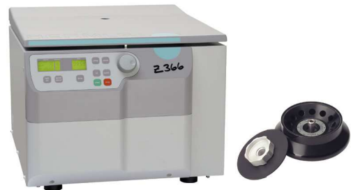
Universal Centrifuge Z 366

max. Speed: 30000 rpm max. Volume: 6 x 250 ml Example rotor: Angle rotor 6 x 250 ml